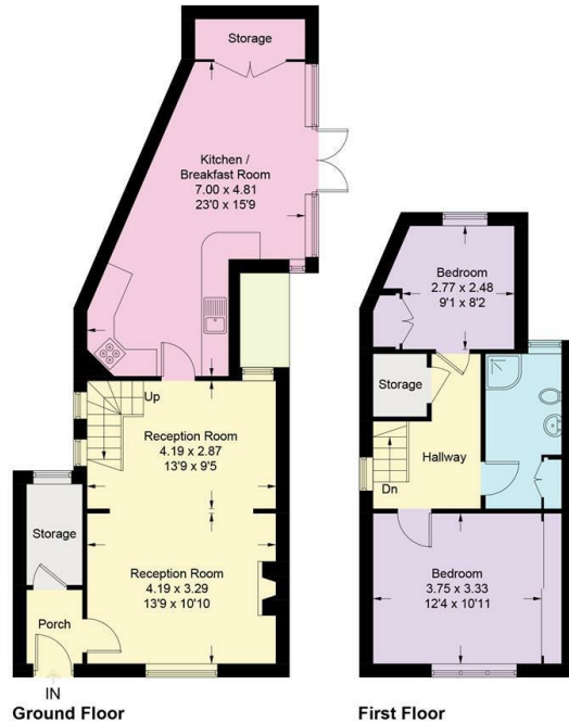
Illustration for identification purposes only, measurements are approximate, not to scale. Fourlabs.co © (ID1277714)

Approximate Gross Internal Area = 92.29 sq m / 993.40 sq ft